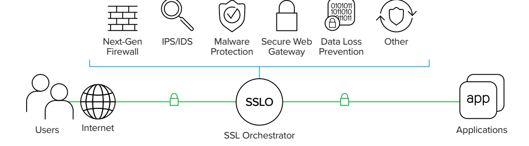
Figure 1: F5 SSL Orchestrator maximizes efficiency and performance for a wide range of inspection devices while maintaining optimal security.

Scales security services with high availability, leveraging F5's best-in-class load balancing, health monitoring, and SSL offload capabilities.