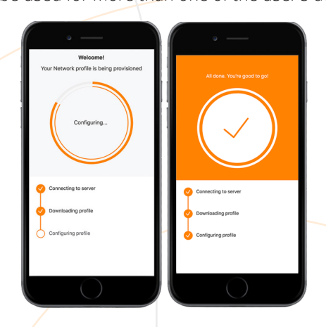
Figure 2: The Aruba Onboard client app provides a seamless way for end users to connect to corporate networks.

Employee devices can easily be configured for seamless connection to wired and wireless networks. Managed through Aruba Central, end users are authenticated through the company's cloud identity store with an enrollment link provided on Aruba Central. Using company credentials to log in, the user will be redirected to the identity store for authentication. Onboarding can be further simplified by leveraging Multi Pre-Shared Keys (MPSK). These are unique per-user passphrases that do not require device registration and can be used for more than one of the user's devices.